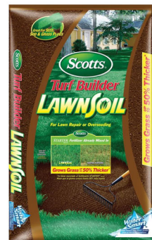
SCOTTS LAWN SOIL 1.5 cu ft Bag