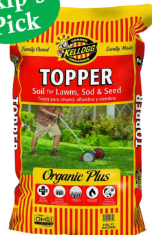
KELLOGG TOPPER 2 cu ft Bag